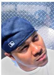
Balance , The "Bay Area Mixtape King" is an Oakland based west coast rapper, whose exposure has reached a national level with his

Finally, he recognizes that there is a difference between information and experience and he vastly prefers the latter.